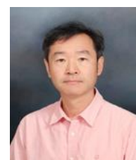
( Corresponding Author)