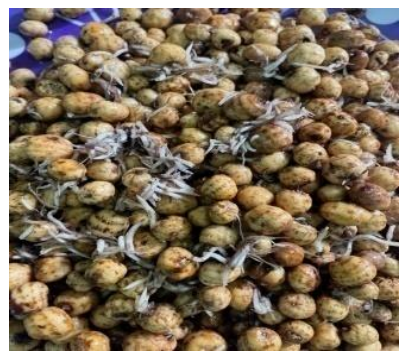
Plate 3: Malted Tigernut