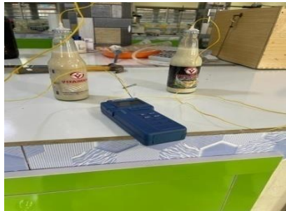
Plate 4: Penetration studies