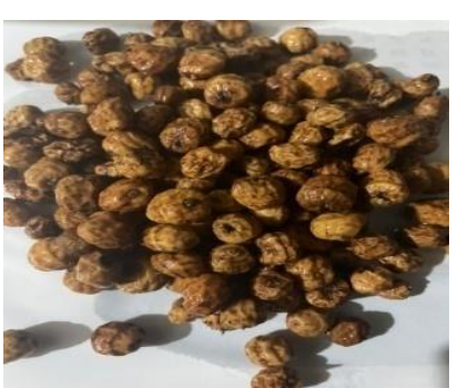
Plate 1: Yellow Tigernut