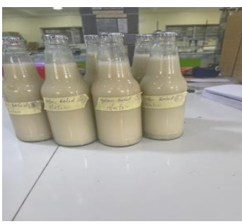
Plate 6: Bottled tigernut milk