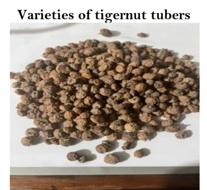
Plate 2: Brown Tigernut