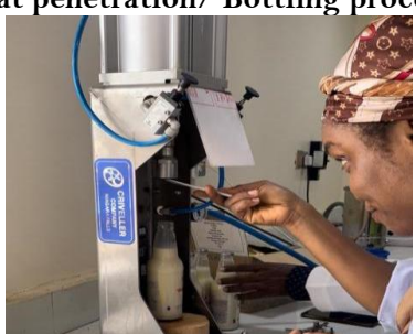
Plate 5: Bottling process