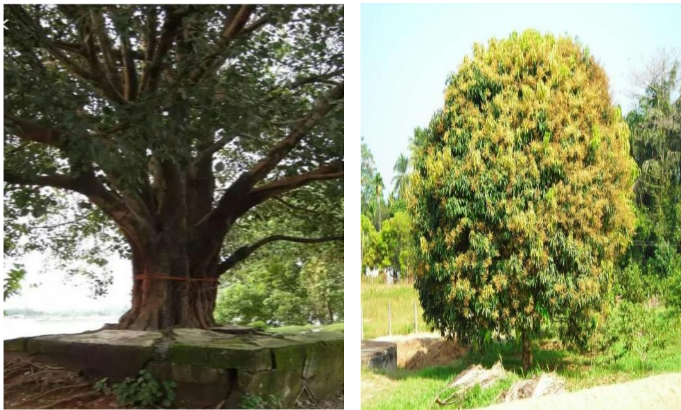
Figure-5. Dust deposition on common selected plants at two different sites.

Ficus religiosa (Peepal tree) recognized for non-secular purpose. They are lengthy and huge trees. It is a great specie for dust trapping. The leaves of Peepal tree are very huge Figure 5 . Therefore, with these characteristics, such species are ideal for trapping of dust. Hence it must be planted close to the roads and on locations in which pollutants stage is excessive.