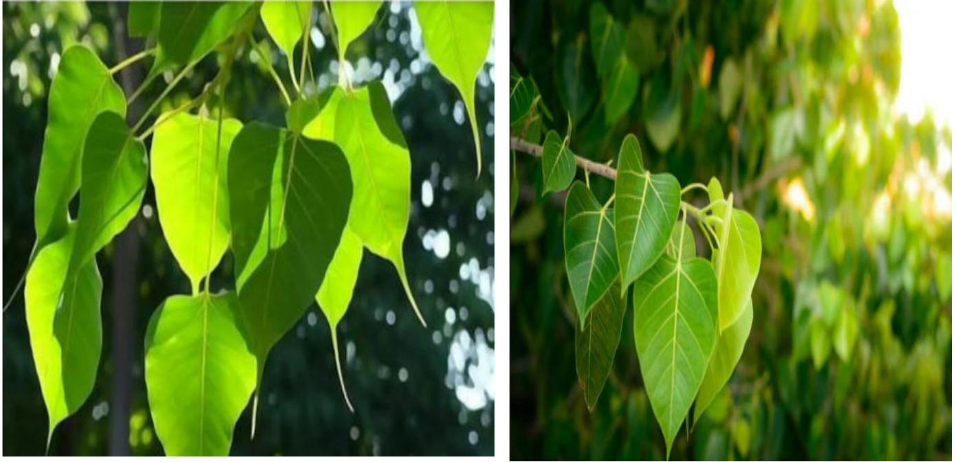
Figure-3. Dust deposition on Peepal plants at two different sites.