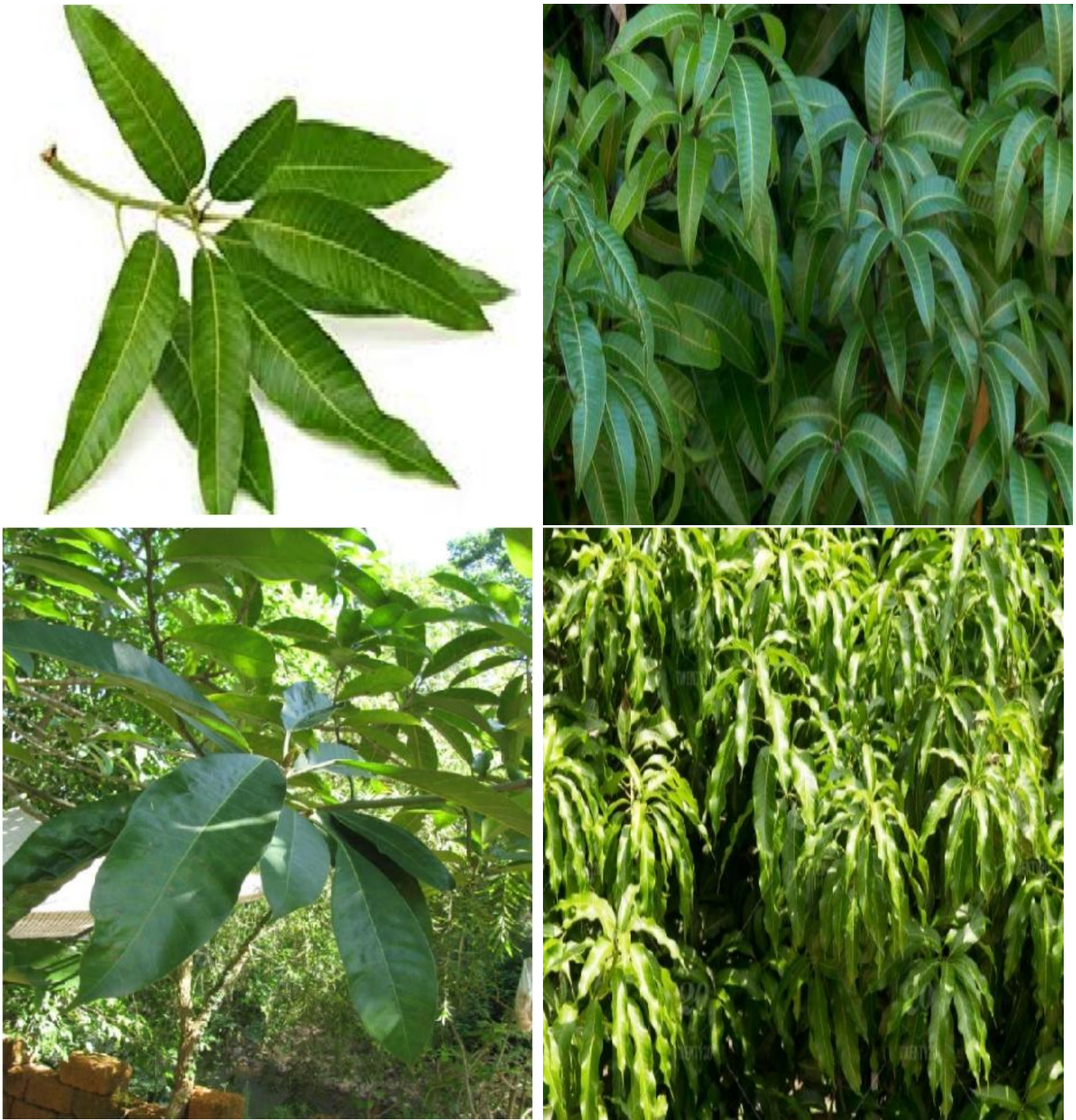
Figure-4. Dust deposition on Mango plants at two different sites.

Peepal tree >Mango tree: A superb correlation has been observed among the dust trapping and micro roughness of the full leaf vicinity. Roughness of top floor may be described because of presence of ridges and