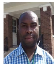
(✉ Corresponding Author)