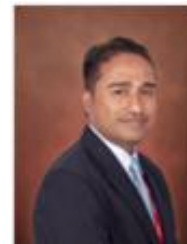
( Corresponding Author)

1 MARA College Kuala Nerang, Kuala Nerang Kedah, Malaysia