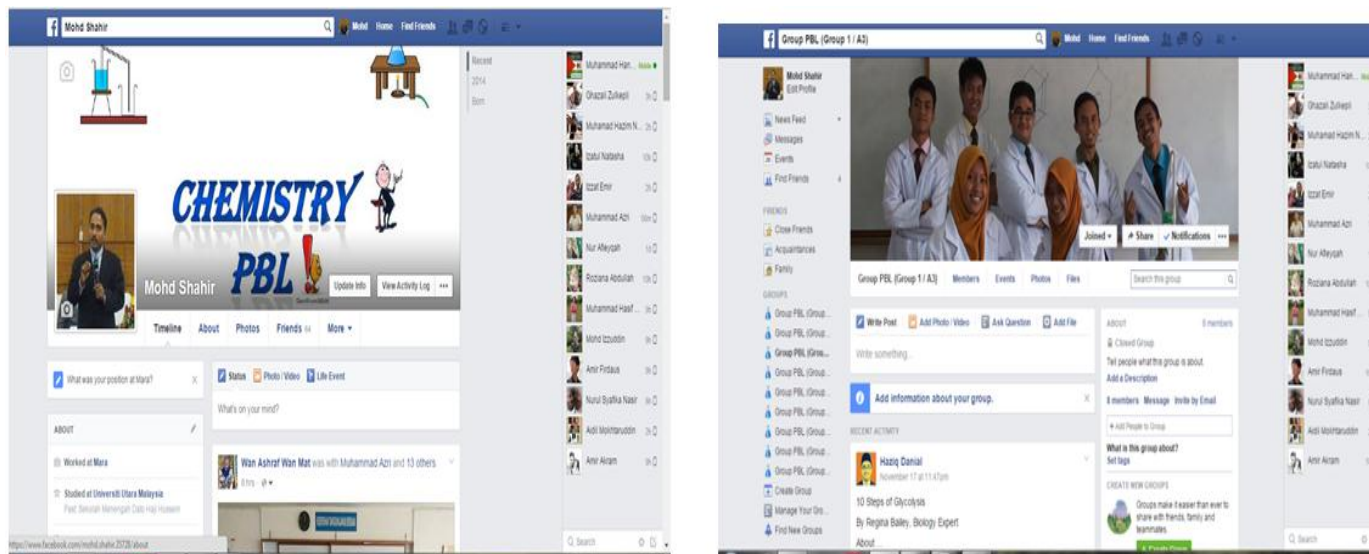
Diagram-1. Sample Front Page Display of One of the PBL Group's Discussion