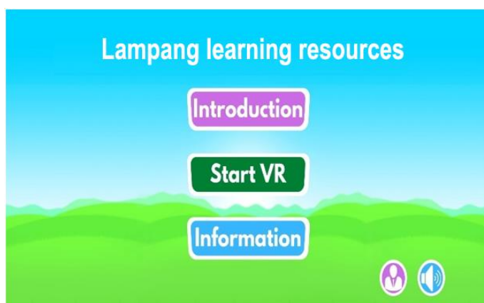
Figure 3. Home screen of the VR Lampung application.

The 'Start VR' button enables a display menu—marked with different numbers and colours (see Figure 4)—of the 10 learning resources, which are: (1) Wat Pong Sanuk Nuea, (2) Wat Phra That Lampung Luang, (3) Wat Phra Kaew Don Tao, (4) Wat Chedi Sao Lang, (5) the Thai Elephant Conservation Center, (6) Dhanabadee Museum, (7) Chae Son National Park, (8) Kad Kong Ta, (9) Ban Sao Nak Lampung and (10) Mae Moh Mining Museum. There are five to eight key points in each learning centre, 360-degree-view photos and audio narrations that stimulate communication and perception. Students can change their position by pressing the red button with numbers in a sequence (see Figure 5).