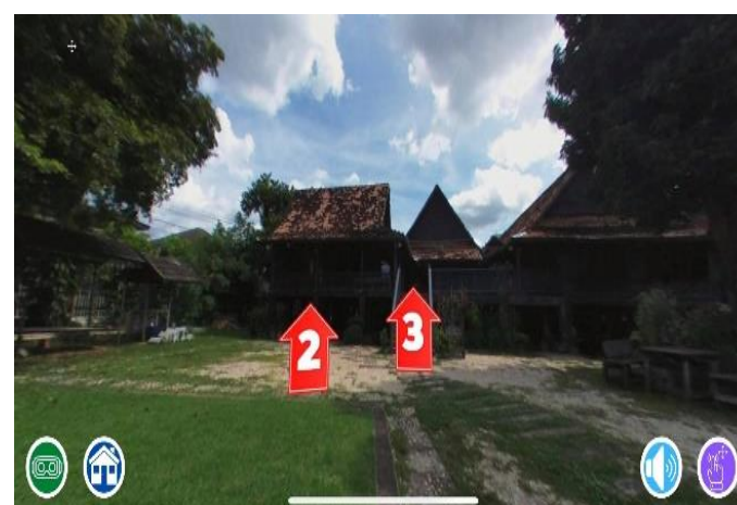
Figure 5. The key points of learning resources VR Lampung application.

There are activities for learners to complete missions in each learning centre. For example, students need to find a treasure box. After that they need to focus on the box then a heart shape will be popup, and there will be an audio narrative. However, the students need to remember the information from the audio narrative. After using the application, students must report what they have learned from the box to their teacher. If they report correctly, they will receive a heart-shaped sticker. (See Figure 6).