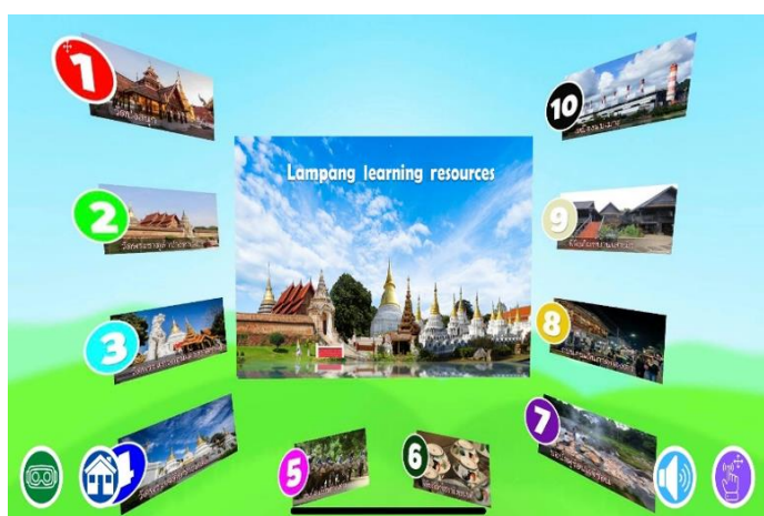
Figure 4. Learning resources menu screen in the VR Lampung application.

The 'Start VR' button enables a display menu—marked with different numbers and colours (see Figure 4)—of the 10 learning resources, which are: (1) Wat Pong Sanuk Nuea, (2) Wat Phra That Lampung Luang, (3) Wat Phra Kaew Don Tao, (4) Wat Chedi Sao Lang, (5) the Thai Elephant Conservation Center, (6) Dhanabadee Museum, (7) Chae Son National Park, (8) Kad Kong Ta, (9) Ban Sao Nak Lampung and (10) Mae Moh Mining Museum. There are five to eight key points in each learning centre, 360-degree-view photos and audio narrations that stimulate communication and perception. Students can change their position by pressing the red button with numbers in a sequence (see Figure 5).