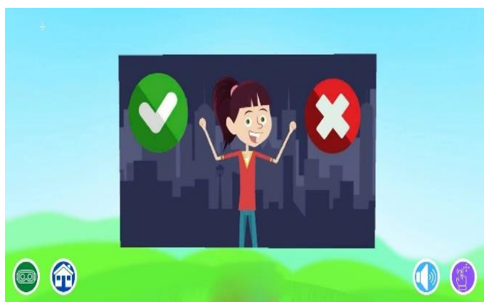
Figure 2. Cartoon character in the VR Lampung application

The VR Lampung application was evaluated for its effectiveness by three experts: media and technology specialists, early childhood education specialists and early childhood education supervisors. The overall performance evaluation was excellent, with an average value of 4.53. A functional test involved 10 kindergarten learners at Lampung Rajabhat University Demonstration School. In this test, the learner saw the start screen before the main menu. The screen was designed in the form of graphics on the learning environment in Lampung Province. Before the main menu, there is an introduction screen; a screen of rules, or regulations, for the visiting learning resources, with a cartoon named Kati as a knowledgeable person (see Figure 2). The main screen consists of the 'Introduction' button, which displays the rules, or regulations, for visiting the learning resources, the 'Start VR' button, which provides access to the resources page; and the 'Information' button, which displays basic information about the resources available in the application (see Figure 3).