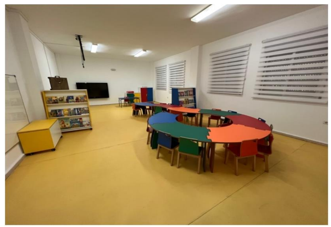
Figure 2. Recently renovated classroom at a primary education centre in the autonomous city of Ceuta.

Transforming students into active participants in their learning process (Parra-González, Segura-Robles, Cano, & López-Meneses, 2020; Valdivia, 2010) will be the main ingredient to achieve real methodological innovation in classrooms. This educational innovation relies on the educational space as an essential tool in the teaching-learning process providing students with an educational environment that fosters social relationships, a productive climate and actively involves all members of the educational community.