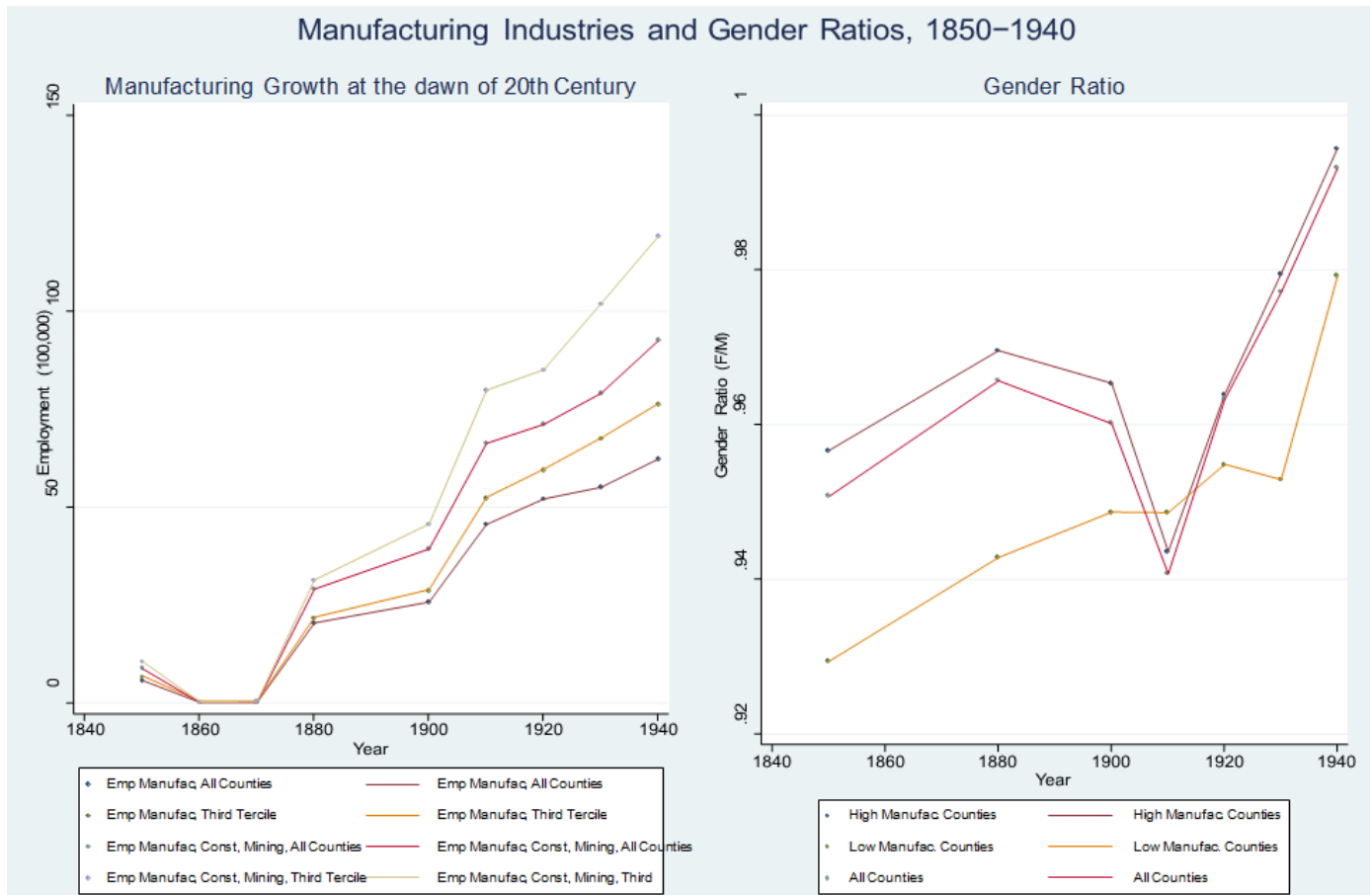
Figure-2. Manufacturing Growth at the dawn of 20th Century.

Notes: Full Count Decennial Censuses are used. First and third terciles of percentage of manufacturing in all industries at county level is used to define high/low manufacturing intensity.