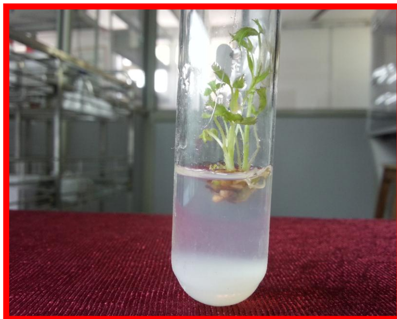
Figure-3. Rooting in half strength of MS+1.0mg/l IBA.

In this study, rooted plantlet with regenerates in the ratio of 2:1 ; vermiculture and soil. 80% of plant growing in laboratory scale and 91% plant successfully grown in green house fig-3 & fig-4 ; Tab-7 & 8 ; Kumar, et al. [13] ; Singh and Syamal [12] .