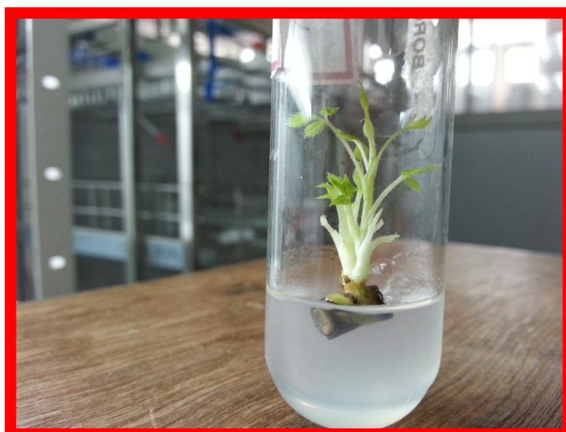
Figure-2. Multiple Shooting on MS medium with 1.5 mg/l BAP and 1.5 mg/l IAA