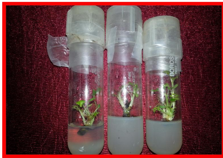
Figure-1. Shoot Formation on MS medium with 1.5 mg/l BAP

In this study, cytokine alone induced as reported by Telgen, et al. [11]. cytokine give the best highest number of shoot formation. The shoots induced from the multiplication culture were further sub-culture for shoot multiplication. In the present study after 14 days observation of multiple shooting in Size 1.0cm (Tab-4), 0.8cm (Tab-5), 0.5cm (Tab-6) length in treatment M3 is the highest multiple shooting (fig-2). Auxin and cytokine combination of the highest number of multiple shooting was reported Singh and Syamal [12]. After the observation of 14 days the highest roots regenerates from shoot of Explant size 1.0cm in 1.5mg/l the highest regenerates 90%., Auxin has positive effective on root growth.