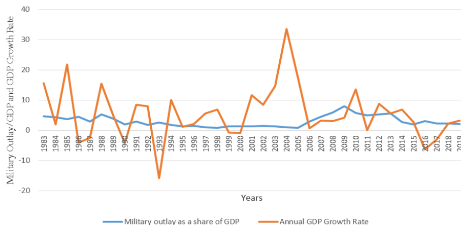
Figure-1. Military outlay as a share of GDP and annual growth rate of GDP, 1983-2019.

Source: World Bank, World Development Indicators (WDI) database.