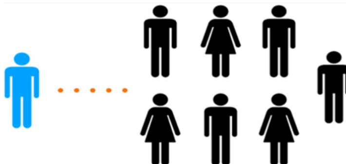
Figure 1. In-person classes.

Figure 1 depicts an in-person classroom setting.